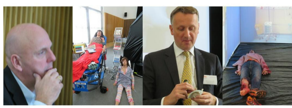
Images from Medilink East Midlands Inaugural Special Interest Group on VR in Medicine

Medilink East Midlands launched a new Special Interest Group (SIG) at a seminar in Nottingham in October, collaborating with the International iTag conference being held at the same time. The focus of this event was the use of virtual reality and 3D technologies in medicine.