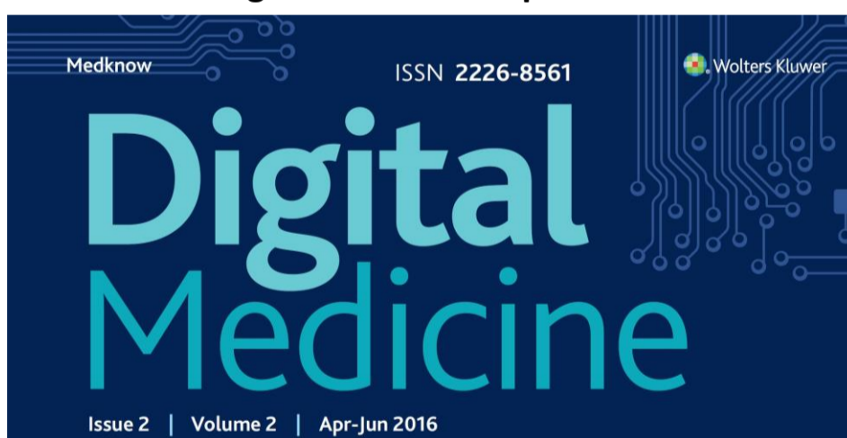
The Journal of Digital Medicine Edited by ISDM

The new relationship and close collaboration with the ISDM has created opportunities for publishing papers, editorial or commentary in the Digital Medicine Journal.