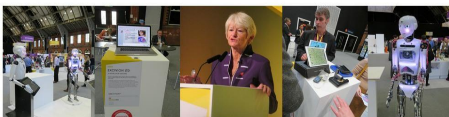
Images from Innovate 2016 held in Manchester

I attended the Innovate 2016 conference in Manchester early in November where digital medicine and health featured very strongly amongst the technological innovations being showcased. The following exhibitors caught my interest with interesting and innovative uses of technology :-