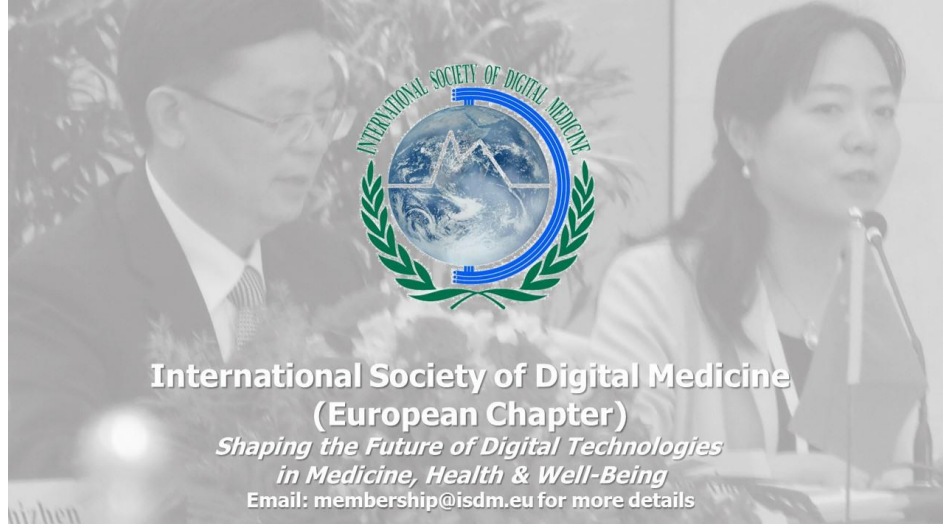
The introductory splash screen of the ISDM European Chapter Web Site – www.isdm.eu

November 2016 sees the soft launches of the European Chapter of the International Society of Digital Medicine in Nottingham and Barcelona. The UK soft launch will take place at the Medilink Joint SIG in Nottingham and the European soft launch is scheduled for November 21 st at the World of Health IT Summit being held in Barcelona (see below).