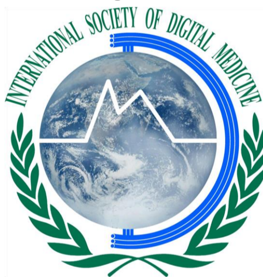
Logo of the International Society of Digital Medicine

There is little doubt that digital technologies will be hugely influential in shaping the future health and well-being of citizens all over the globe. Digital Medicine is the marriage of one of the newest phenomena in mankind's history, digital technologies, to one of the oldest disciplines known to man, medicine.